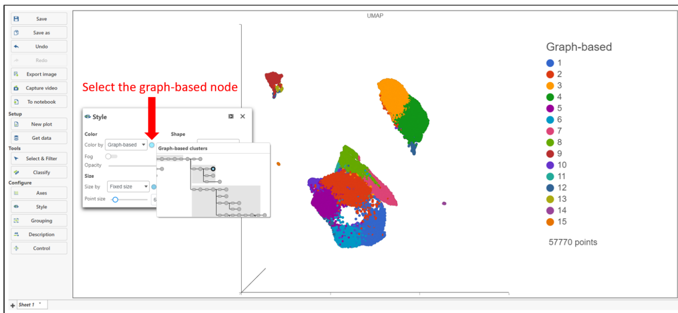
Figure 2. Visualizing Graph-based clustering results

The Clustering result data node includes the input values for each gene and adds cluster assignment as a new attribute, Graph-based , for each observation. If the Clustering result data node is visualized by Scatter plot , PCA , t-SNE , or UMAP , the plot will be colored by the Graph-based attribute (Figure 2).